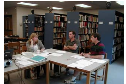
Teachers at Palmer High School working on curriculum guides