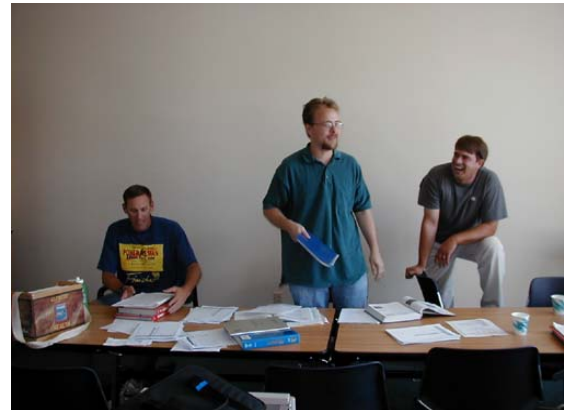
Teachers representing all grade levels and disciplines at the Stetson School in Barre, MA have been developing rubrics for students with alternative learning needs.